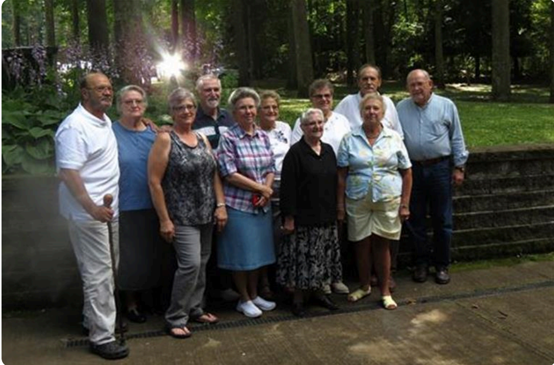
Landi Reunion 2015 1st. cousins present.